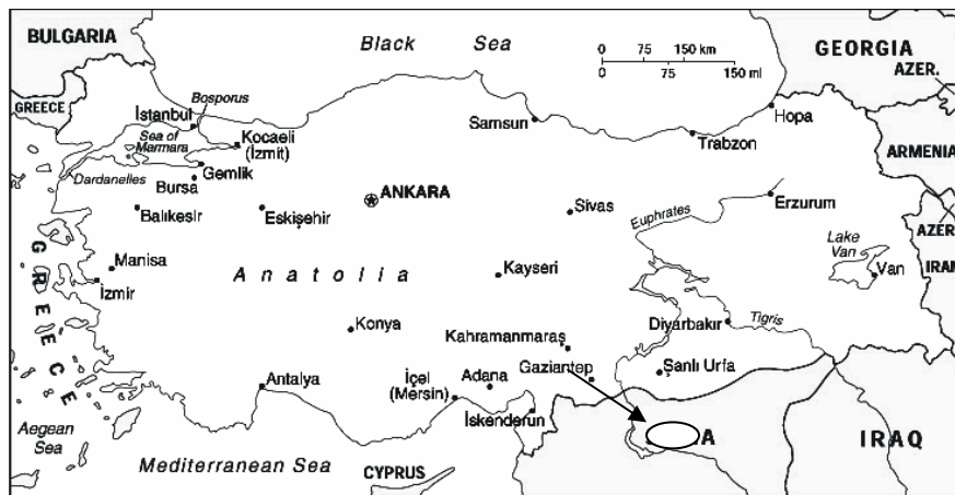
Fig. 1. Location of study area in Turkey (Sanliurfa).

There is no significant knowledge about the change of chemical and physical properties of soil, the formation of natural vegetation, and succession on land that is exposed to fire in the Southeastern Anatolia Pr or (GAP). The city of Sanliurfa is in the center of the GAP region (Fig. 1). The nearby villages of Cekem and Dagetegi were studied. These are located near the city of Sanliurfa in southeast Turkey. It comprises 300 hectares. The altitude of the area ranges between 550 and 600 meters.