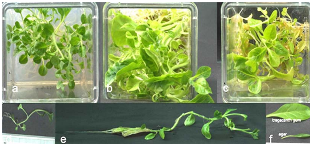
Fig. 1. Germination of tobacco cv. Samsun Canik on (a) agar, (b) 11 g/l tragacanth gum, (c) 15 g/l tragacanth gum, (d) shoot length on agar, (e) shoot length on 11 g/l tragacanth and (f) comparison of the leaf length on tragacanth gum (11 g/l) and agar (7 g/l).

15 g/l tragacanth were partially chlorotic but their number was statistically similar to the number of leaves noted on 7 g/l agar in MS medium.