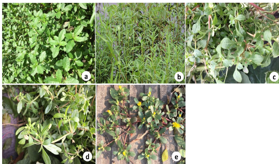
Fig. 1. Fresh samples of five studied leafy vegetables namely, (a) Alternanthera sessilis , (b) A. philoxeroides , (c) A. paronychioides , (d) Glinus oppositifolius and (e) Portulaca oleracea .

Concentrated extracts were stored at 4° C for further analysis.