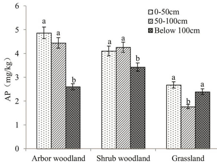
Fig. 3. Soil available P content in different land use types.