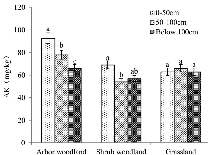
Fig. 4. Soil available potassium content in different land use types.