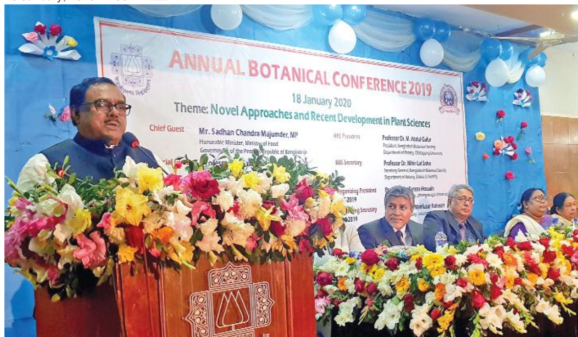
Food Minister Sadhan Chandra Majumder speaks at a programme titled 'Annual Botanical Conference-2019' at Jahangirnagar University campus on Saturday.